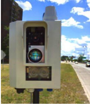
Figure 1 – Enforcer Speed Camera System by LogixITS

Contrary to radio waves used by radar-based traffic enforcement systems, the infrared light beam emitted by the M16 is virtually undetectable by common means. The M16 also benefits from a greater freedom of placement than radar when it comes to angular positioning in an operational context.