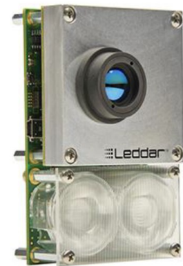
Figure 2 – LeddarTech's M16 multi-segment flash LiDAR sensor module

It is simple to start developing with the M16, which can easily be purchased and comes with an SDK.