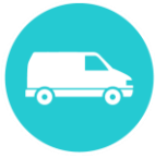
Autonomous Delivery Vehicle