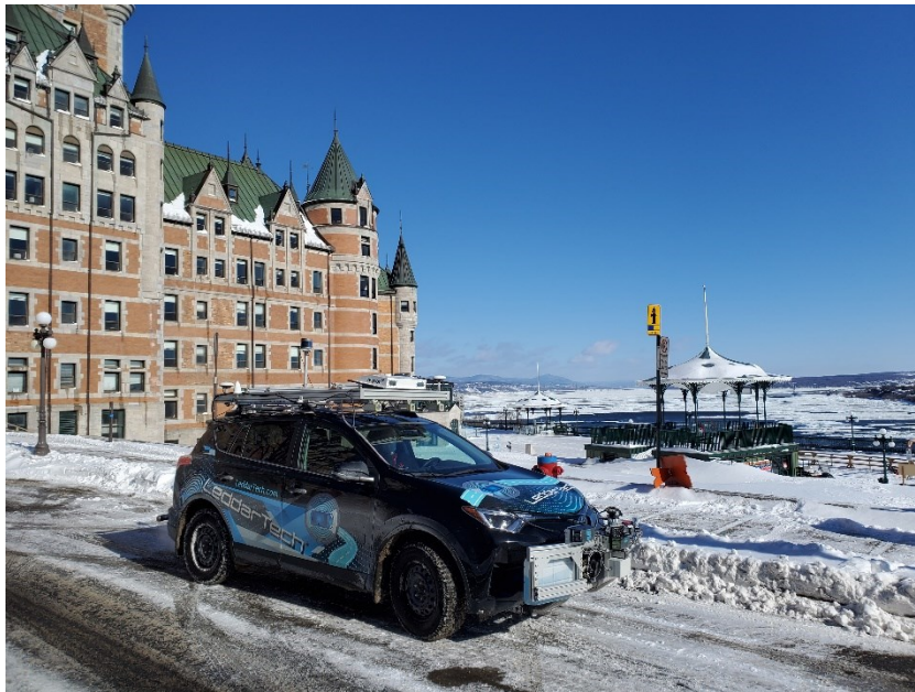
Figure 5 – LeddarTech testing its autonomous vehicle, LeddarCar™, in snowy conditions