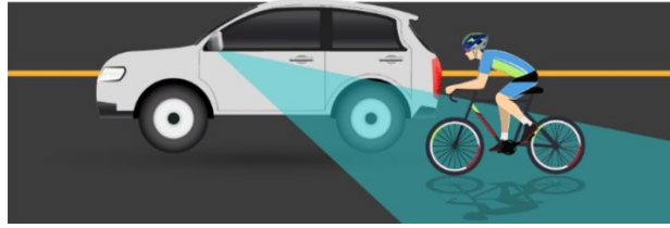
Figure 2 – Blind spot detection and intervention system