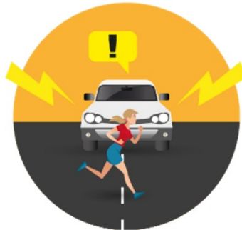
Figure 3 – Pedestrian automated emergency braking

Scenarios 1 and 4 are proposed for inclusion in U.S. NCAP, but not scenarios 2 and 3. The latter two scenarios have not been added because commenters mentioned that the available technology would add a significant number of false positive detections and that ADAS sensors would need an expanded field of view.