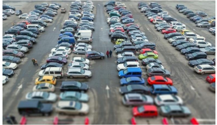
Figure 4 – Parking lots are complex, unpredictable environments

Considering that lives are at risk, we expect that automated systems will outperform human drivers. Vehicles equipped with automated valet parking must be able to navigate through challenging infrastructures, react to unpredictable events, and remain reliable throughout changing environmental conditions, which requires very sophisticated hardware and software. Today, many passenger cars have park assist systems that help the driver during the parking process. Such systems require that the driver navigates the vehicle through the parking lot while the system locates a vacant space. Once a parking space has been identified, the driver may leave the steering control to the system but must keep control of the speed of the vehicle and the braking system. In the automated valet parking context, the vehicle needs to be able to execute its core function as well as to react to events coming from the outer environment without requiring human intervention. In these conditions, AVP becomes so complex that some companies developing AVP are looking into adapting the infrastructures and even creating specific robotic platforms as a first step to fully automated valet parking. For example, Bosch/Daimler has adapted an underground lot with external sensors to