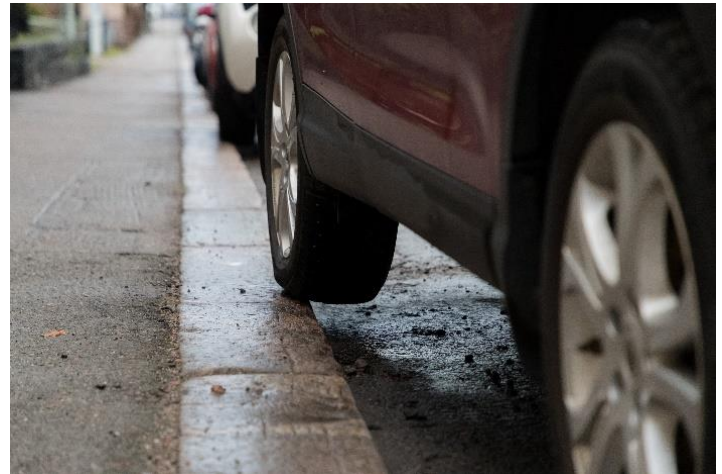
Figure 7 – Curbside parking can prove challenging for many drivers

Achieving reliable short-range detection is crucial to execute parking maneuvers around cramped infrastructures, narrow parking spaces, and surrounding vehicles. For parallel parking, in some countries or States, a vehicle must be parked within 30 to 45 cm from the curb. If the sensors are not accurate enough, the result could be a vehicle that is parked much too far from the curb or, conversely, runs over it.