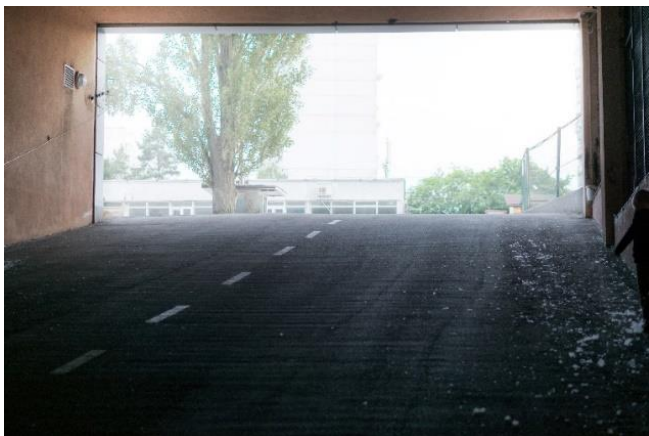
Figure 2 – Parking exit with changing light conditions

Also, some areas only have parallel parking spots, which can be troublesome for drivers who are unfamiliar with this.