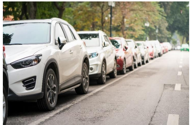
Figure 3 – Narrow parallel parking