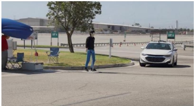
Figure 6 – Testing of pedestrian detection systems (source: AAA)

In a parking lot, pedestrian behaviors are difficult to predict and may require an abrupt reaction from the AVP system. The system must be able to detect pedestrians at up to 20 m for predictable behaviors and be highly reliable at shorter ranges (from 0 to 10 m) to account for unpredictable behaviors. At a speed of 20 km/h, if we consider a comfortable braking deceleration, it will take about 10 m to bring the vehicle to a full stop, to which a security factor must be added to enable the initial identification of the pedestrian.