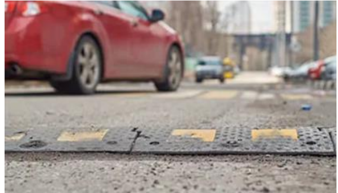
Figure 11 – Paint faded on speed bump

With radars, a low resolution can make detection less accurate at short range. Furthermore, a confined environment with closed walls such as underground parking lots can create interference and make it difficult for radars to accurately detect objects at short range.