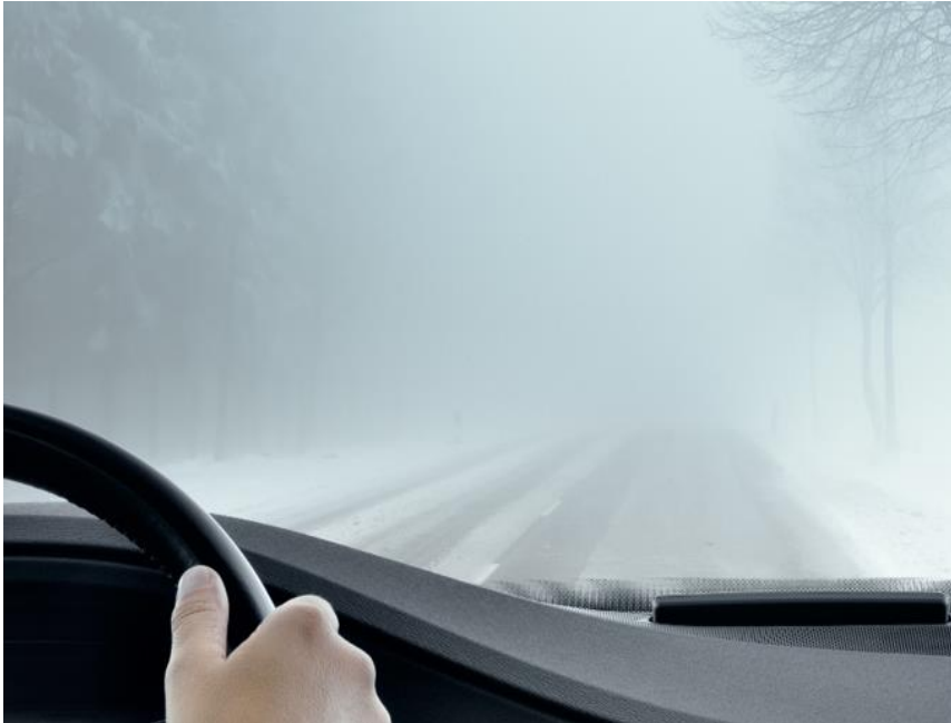
Figure 12 – Reduced visibility due to fog

As fog is composed of very small particles of water, its impact on visibility can be explained mainly by the absorption of energy and the scattering of light. Rain will have a higher impact than fog, with physical particles accumulating on the surfaces such as the road and the vehicles, changing their reflectivity, and with water droplets on the sensor lens obstructing the emitted and received light. These negatively impact the system's level of confidence to detect the objects, to determine their distances, and to identify their nature.