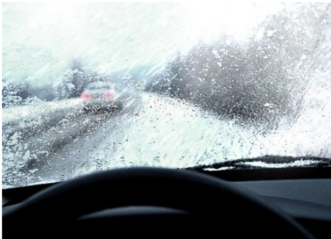
Figure 5 – Reduced visibility due to snow

Parking in harsh weather conditions is a burden that users will expect the AVP solution to resolve, after dropping all passengers off at the door. This is challenging both for autonomous systems and humans. In situations where there is rain, snow, or fog, the visibility is reduced, making it harder to see objects ahead