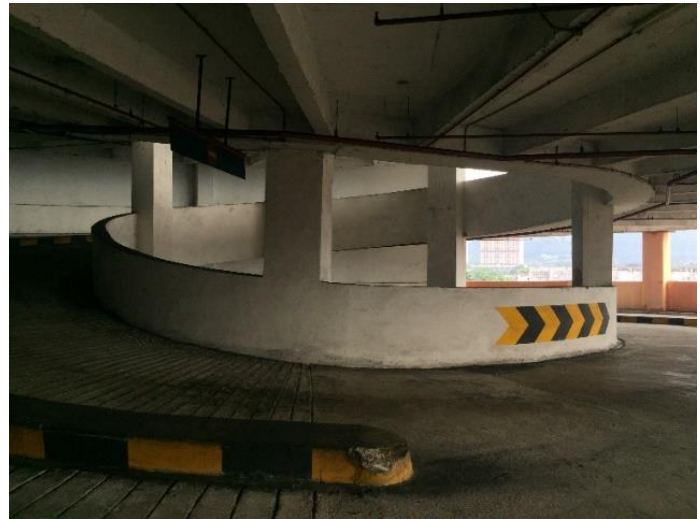
Figure 1 – Spiral pathway in an underground parking lot

As well, exiting an indoor parking lot on a bright sunny day may turn out to be difficult as strong lighting contrasts reduce the visibility ahead.