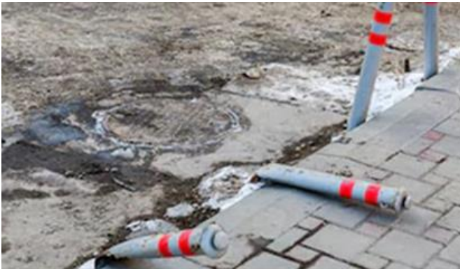
Figure 8 – Damaged pillars

In light of the above, the sensors used must enable close detection with a strong level of confidence.