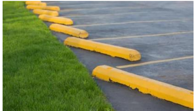
Figure 9 – Parking lot stops

Ultrasonic sensors (sonars) are often used for short-range detection, being affordable and easy to integrate with the vehicle design due to their small size. However, because this technology uses sound signals which are more sensitive to the outside environment, some situations can prove more challenging for sonars. For example, curved areas might cause the sonar signal to be thrown off (Figure 10), and even wind could blow away and fade the signal.