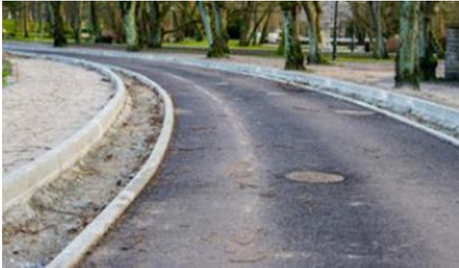
Figure 10 – Curved curb throws off the ultrasonic signal

Camera sensors also face challenges for short-range detection. For example, when light and color contrasts are lower, it can then be very difficult to differentiate between a speed bump on which the color has run off and the road surface (Figure 11), which could lead the vehicle to maintain its speed across the bump.